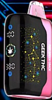
PINK GREEN CRACK